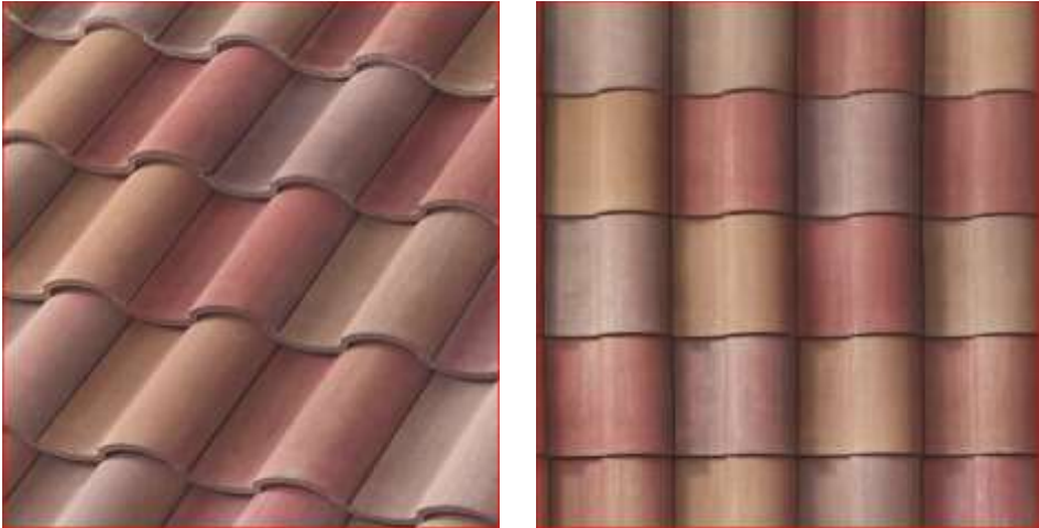
Villa 900 – A high profile roof tile that features a single roll. Size: 17” x 13”