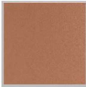
HC 167 Terra Cotta