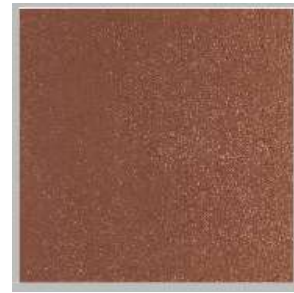
HC 102 Red Terrazzo Tile