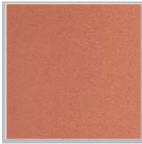
HC 126 Naturally Red