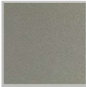
HC 172 Muddy Gray