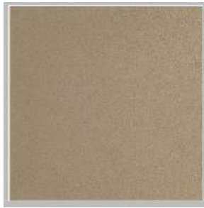
HC 165 Fresh Concrete