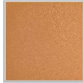
HC 159 Terracotta Orange