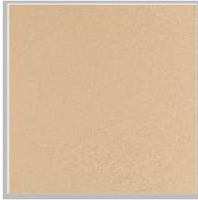
HC 125 Neutral Balance Tan