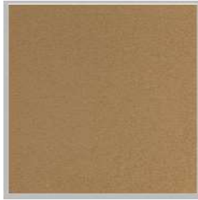
HC 117 Silk Chocolate